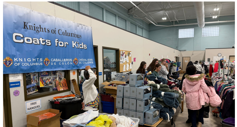
Left: members from Flint area councils gather at Center for Hope to distribute coats. Above: Racks of coats and tables of blankets and other items.