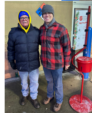
Council members at Sam's Club on November 30, 2024. See article for list of members who participated.