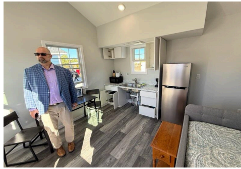
Top right: Opening of Veteran Village in multipurpose room. Above: Interior of one of the bungalows.

On Monday, October 20, 2025 a ribbon-cutting ceremony and open house took place at Sacred Heart Veteran Village in Flint, on the site of the former Sacred Heart Church property. 4 th Degree Color Corp participated. This Catholic Charities project is supported by Assembly #510. When completed, the village will include 26 individual housing units for veterans and will provide training, counseling, and other services for veterans.