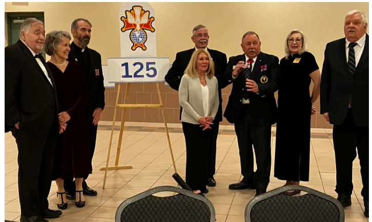
Admirals Ball held February 22, 2025 - lots of fun, great food, dancing and funds going to Sacred Heart Veterans Village. Assembly 510 Officers and Ladies along with State 4th Degree Officers.

If you would like to view the Crusader online, it can be found at www.kofcflint.org . If you would like to receive a copy via email or no longer wish to receive it, send your request to fs695@mikofc.org .